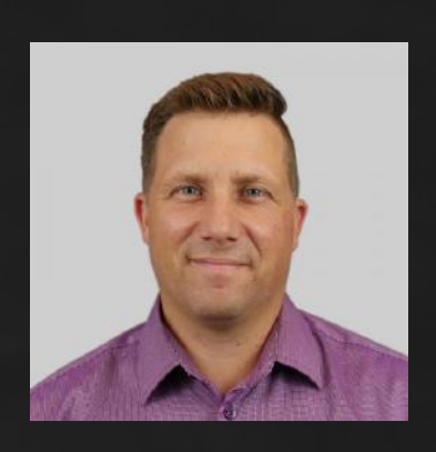
LEGER CEO CAREER YEAR ACADEMY HOW TO IMPRESS AT YOUR NEXT INTERVIEW